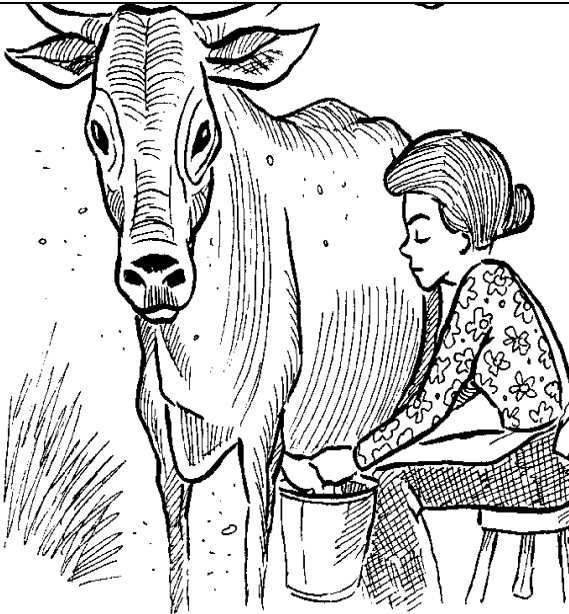
This Girl is Milking a Cow.