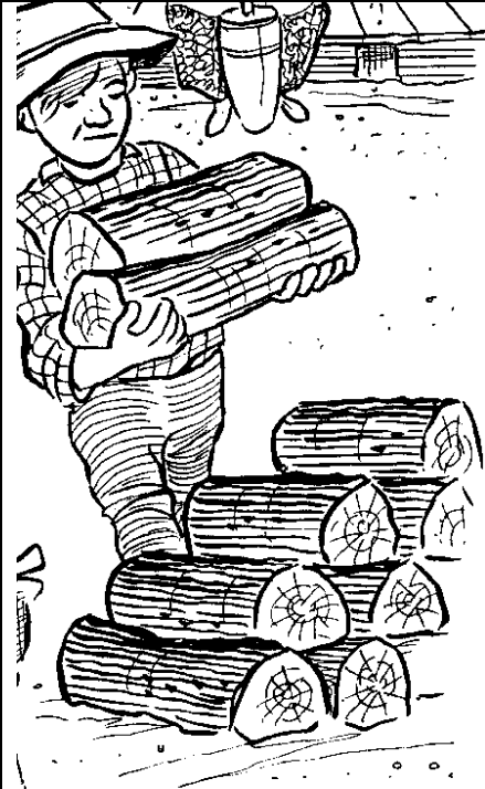
This Boy is Collecting Wood for the Fire to stay Warm.