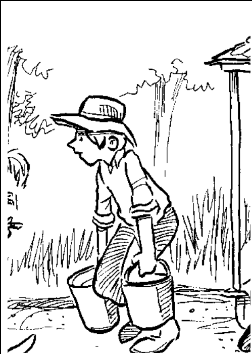
This Boy is Collecting Water.